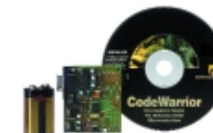
Motorola's comprehensive development tools make it simple to incorporate HC08 Q microcontrollers into your designs.